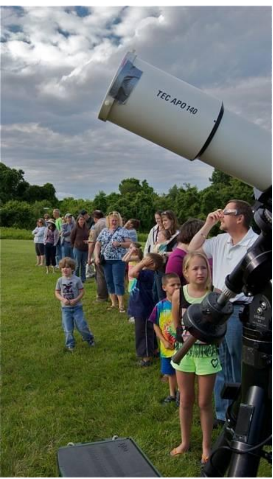
Waiting in line for Transit of Venus June 5<sup>th</sup>, 2012 at Observatory Park, 925 Springvale Road, Great Falls, VA